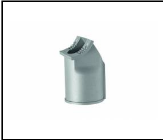
mounting grip 78 mm (UL00229)