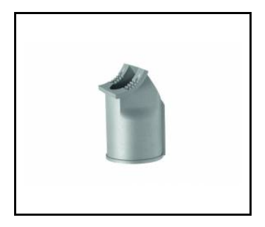
mounting grip 78 mm (UL00229)