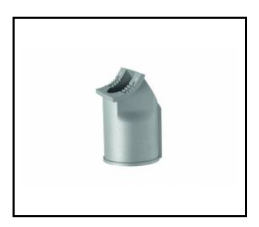
mounting grip 78 mm (UL00229)