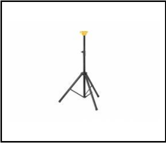
FUTURE STAND Tripod with Click Head System (000737)