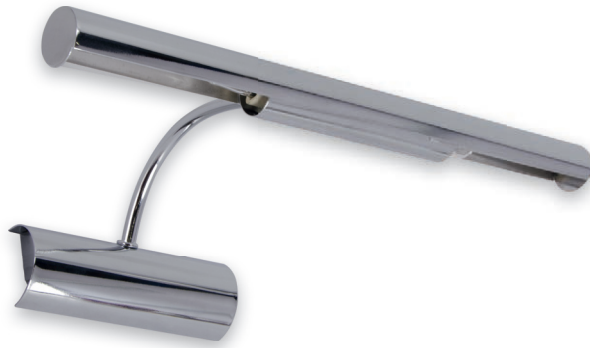
① NADIA G9 CHROME