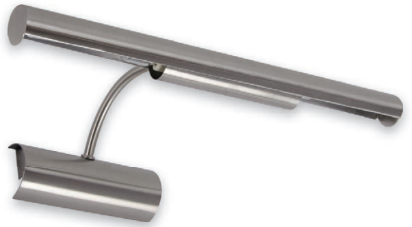
② NADIA G9 MAT CHROME