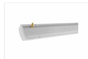
ATLAS LED 1150mm 4500lm 840 - moduł świetlny (952029)