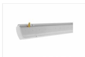
ATLAS LED 1450mm 6000lm 840 - moduł świetlny (952036)