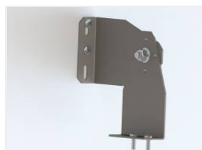
TYTAN LED, ATLAS LED, INDUSTRY LED - uchwyt regulowany (kpl. 2 szt.) (908200)